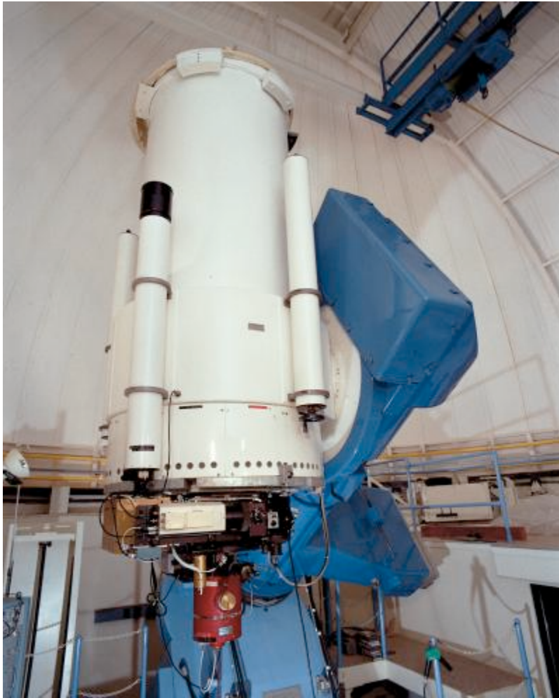
0.9m Telescope at Kitt Peak National Observatory